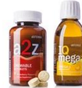
Kids Kit (10 Mega® & dōTERRA a2z Chewable™) 15 PV $32.50