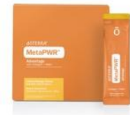
MetaPWR Advantage® 45 PV $65.00