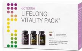
dōTERRA Lifelong Vitality Pack 21480001 | 60 PV $80.50