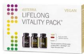
dōTERRA Vegan Lifelong Vitality Pack 60201121 | 60 PV $89.50