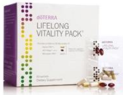
dōTERRA Lifelong Vitality Daily Packs 60205416 | 60 PV $86.50