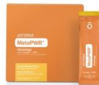
MetaPWR™ Advantage 60222772 | 70 PV $84.50