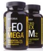
dōTERRA Daily Nutrient Pack 21490001 | 50 PV $59.50

... choose up to 3 additional supplements at reduced prices.