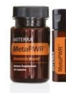
MetaPWR Assist & Beadlets 15 PV $25.00